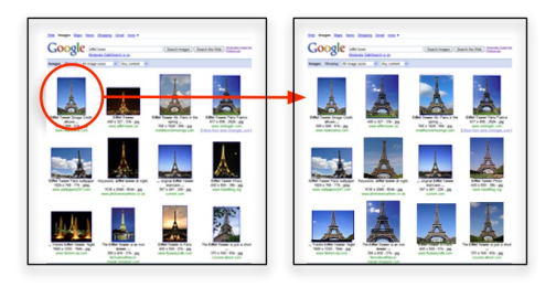
Figure 1: Current query- and content-based Web image search engines present search results as a relevance-ordered list.